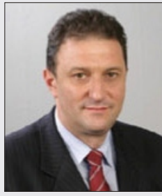
Mr. Peter Mutafchiev, Minister