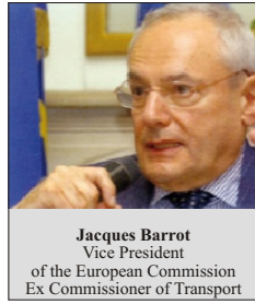
Jacques Barrot Vice President of the European Commission Ex Commissioner of Transport

As a global regulatory body for the international shipping industry, IMO has been, and continues to be, the focal point for, and the driving force behind, efforts to ensure that shipping becomes safer and cleaner. Maritime Safety and SAR Operations are one of the multi-faceted areas of work in which IMO is engaged.