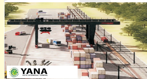
YANA Intermodal Terminal Operator