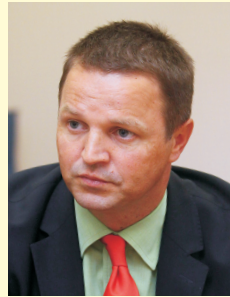
Kamen Kichev Deputy Minister