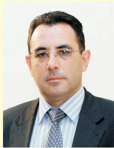
Aleksandar Tsvetkov Minister