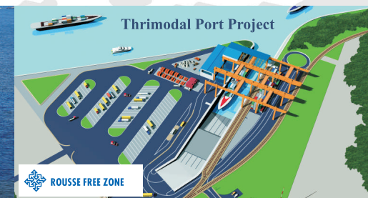
ROUSSE FREE ZONE Freight Industrial Logistics Operator