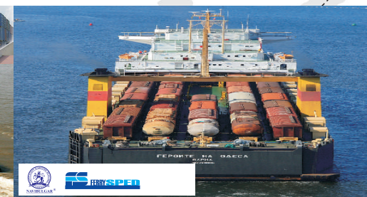
ISREKA Shortsea Ferry/RoRo Operator