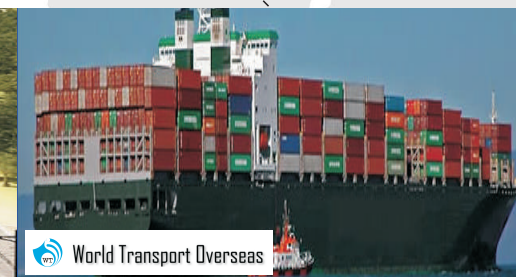
World Transport Overseas Intermodal Operator