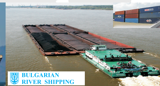
BULGARIAN RIVER SHIPPING Inland Shipping & Port Operator