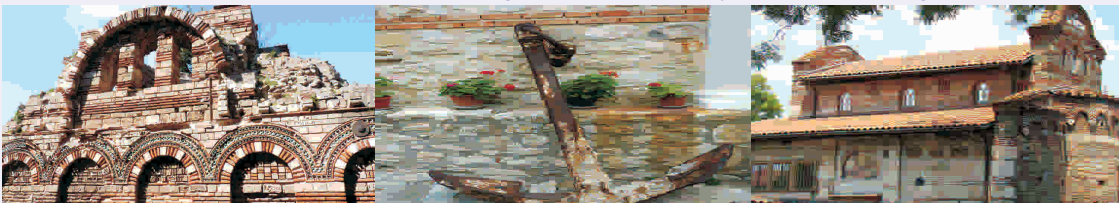
Venue Grand Hotel Primoretz *****“WHERE TRADITION COMES TO LIFE”