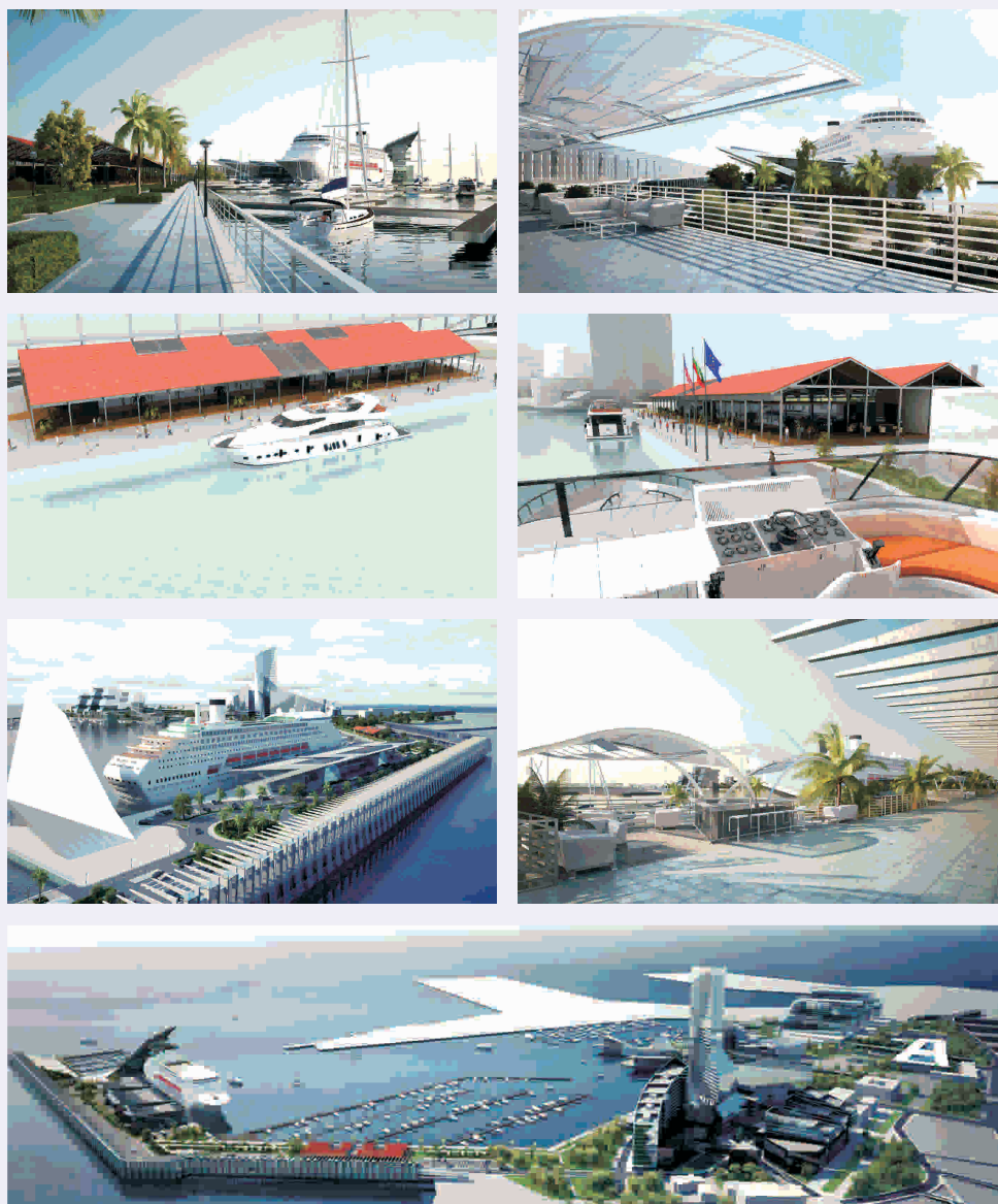
First Modern Specialized Cruise and Marina Port Terminal in Black Sea

The future plans of Port Burgas include development of Terminal East as a new project Public Access Area or Super Burgas, which has intermodal focus (water, rail and road transport connection) and opening of the port for visitors and citizen, as well as development of passenger and yacht servicing.