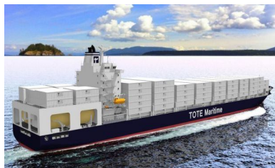
LNG as marine fuel